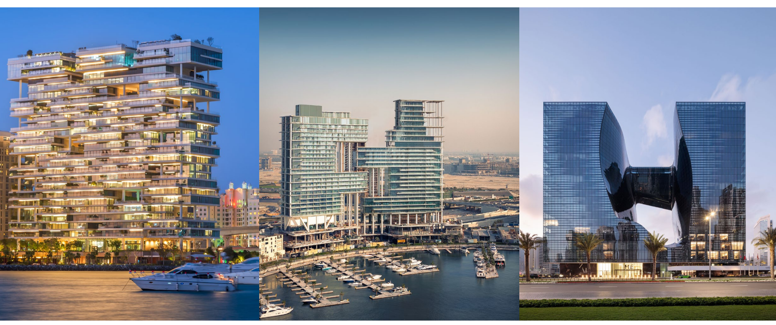
THE RESIDENCES, DORCHESTER COLLECTION, DUBAI

OMNIYAT's impressive portfolio, with a combined gross realisation of over AED 17 billion, includes stars such as The Opus by OMNIYAT, One at Palm Jumeirah, Dorchester Collection, Dubai and The Residences, Dorchester Collection, Dubai.